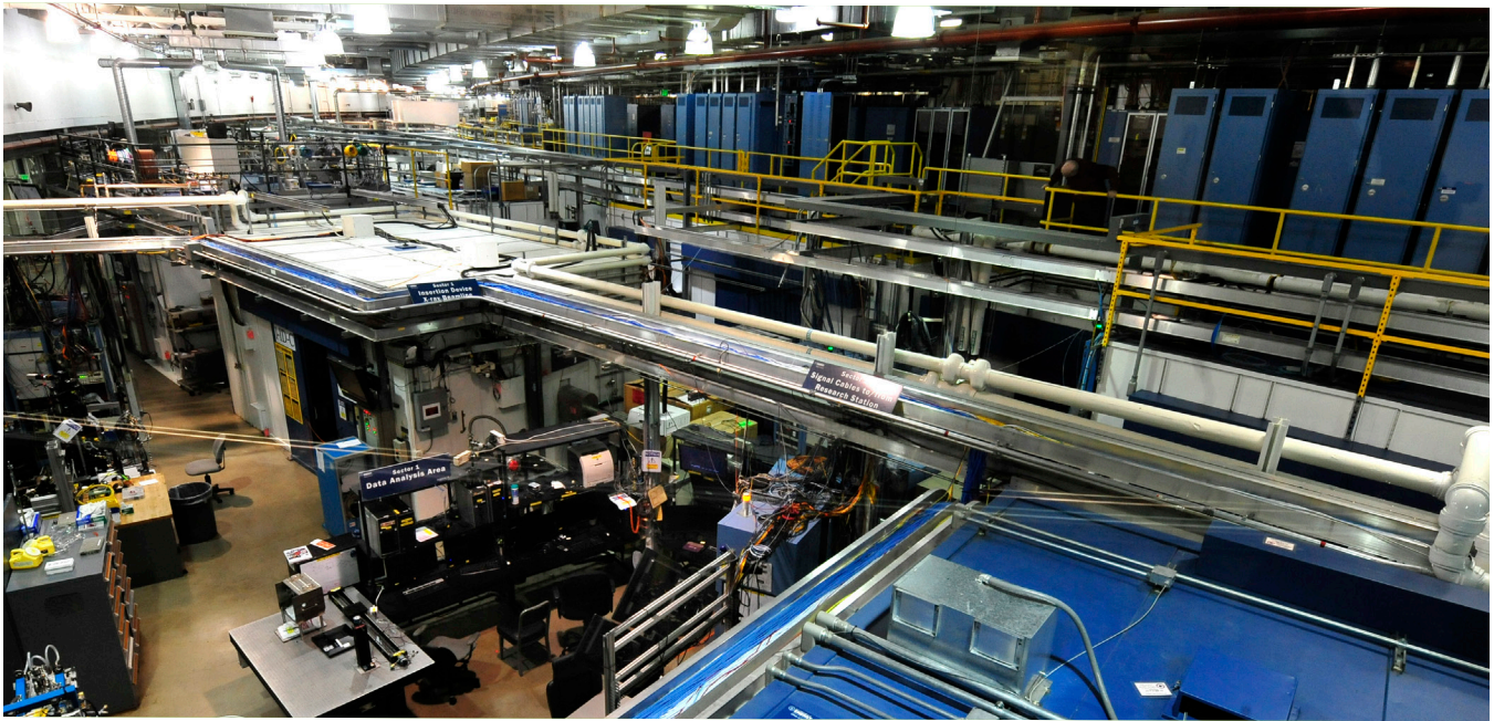
U.S. Department of Energy's Argonne National Laboratory (ANL)

The focus on dynamic charge acceptance (DCA) for automotive lead batteries and cycle life for energy storage systems (ESS) has uncovered new formation treatments, active material additive developments, and key understanding of discharge processes that impact both charge acceptance and the longevity of lead battery electrodes. The work at ANL could be augmented by the ESGC – creating strong opportunity for further advancements and translation of some of these findings into the market.